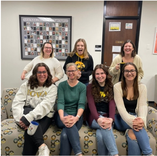
Figure 1: The Shanonistas