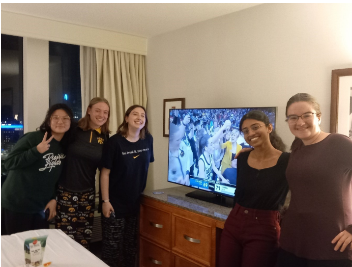
Hawkeyes in Saint Louis